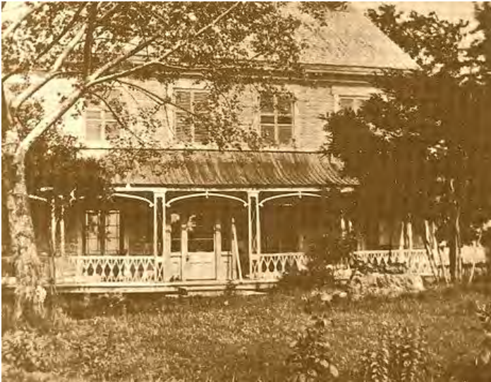
The Aaron Merrick House, c 1900

No better example is evident than that seen in Merrickville's most dramatic stone home, known as "The Manor House"