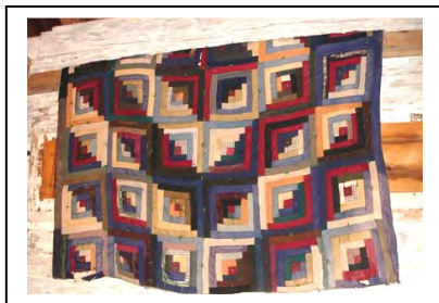
Primitive pine cupboard Antique Log Cabin quilt