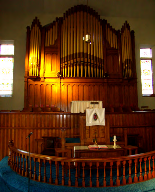
United Church Pipe Organ