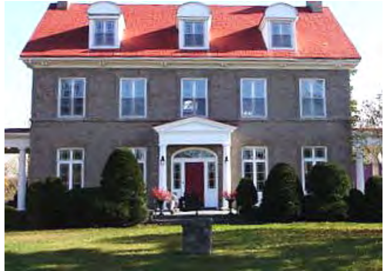
The Manor House c 2011

In our archives we have several examples of these "Then and Now" photos. None more dramatic than this one. Many are of residences in and around the village. Others are of commercial buildings. But, we feel certain that you, our members have others which you would enjoy sharing. To start the ball rolling we are showing this fine example and asking members to allow us to borrow old photos to make digital copies which we can then share with our members.