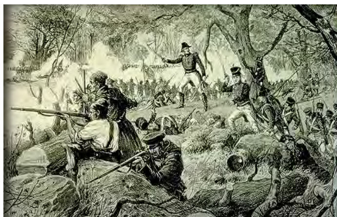
Battle of Chateaugay, Fall 1813

In the Fall of 1813, both American armies got underway. Hampton's army moving toward Montreal from Plattsburgh turned back south of the city after a spirited resistance by French-Canadian troops on the Chateauguay River. The huge American army of James Wilkinson on the St. Lawrence, stung but not defeated by a rear guard's loss against a small following force of British and Canadians at Crysler's Farm, gave up its descent on Montreal on receiving news of Hampton's reversal, and moved into winter quarters in New York State. The most serious threat to Canada of the war was over.